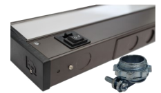
3/4" KOs Cable Connector Included